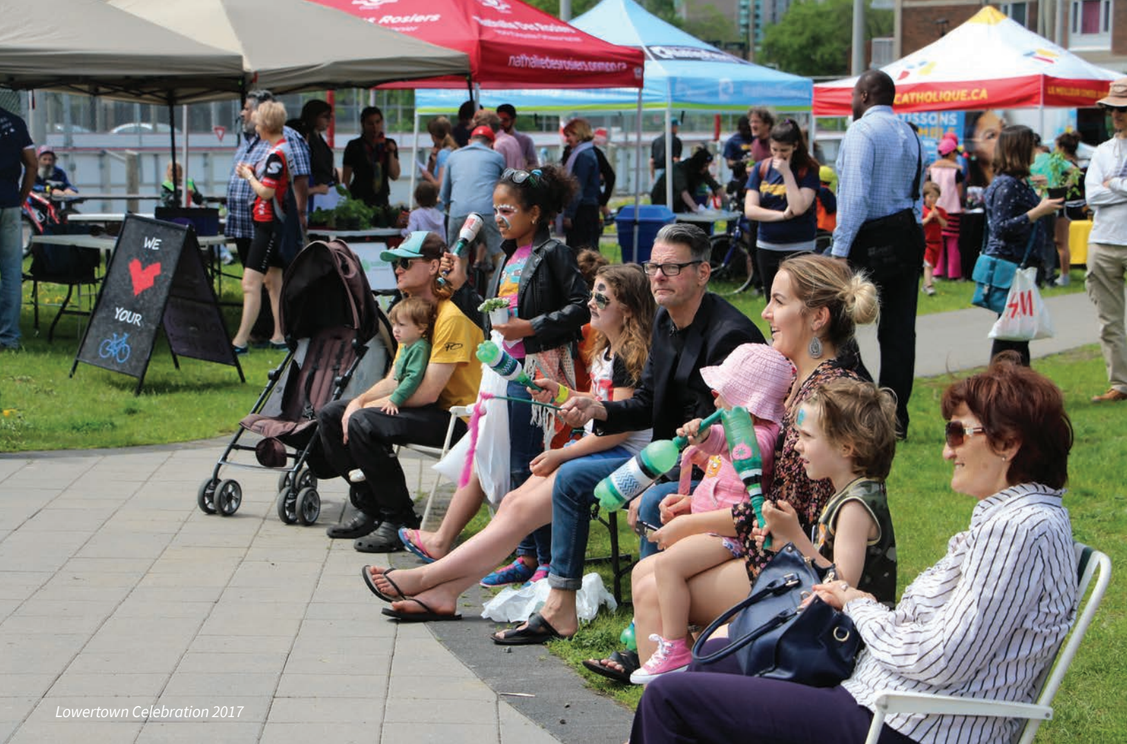
Lowertown Celebration 2017