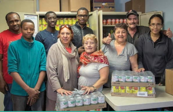
Community House food bank volunteers