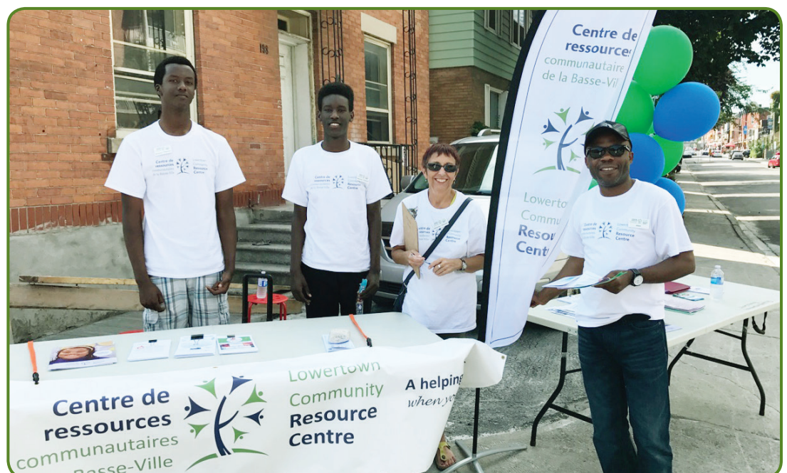
LCRC outreach – Open House October 2017