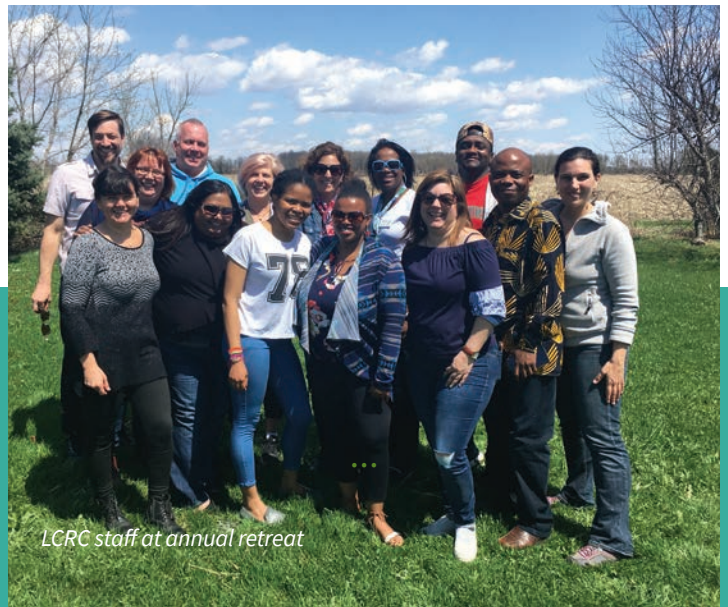
LCRC staff at annual retreat

40 Cobourg Street (613) 789-3930 reception@crcbv.ca Community House: 145 Beausoleil (613) 562-2925