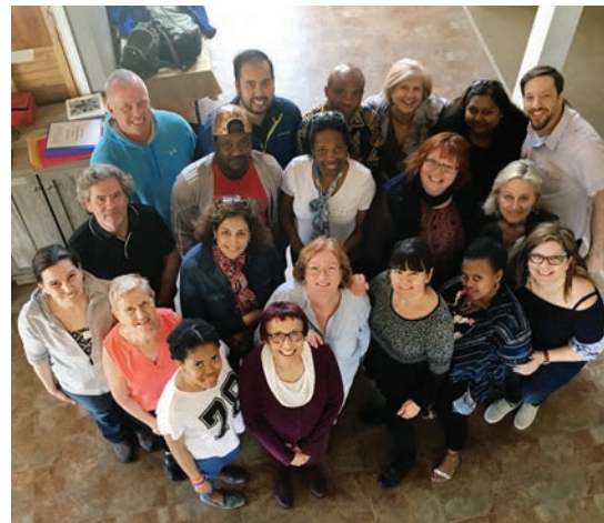
LCRC staff and Board of Directors