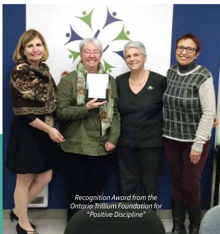
Recognition Award from the Ontario Trillium Foundation for "Positive Discipline"

40 Cobourg St. (the Centre) 145 Beausoleil St. (Community House) reception@crcbv.ca 613.789.3930 (the Centre) 613.562.2925 (Community House)